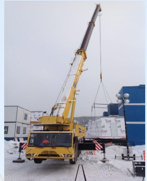
Demag AC 200 hydraulic crane setting up a camping module – Unit manufactured by RCM Modular. ➔

Construction on the initial facilities is completed, and the camp is ready for workers who will carry out the rest of the work.